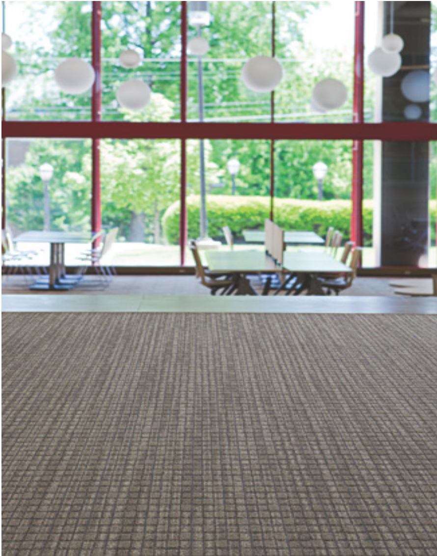
Broadloom room scene with Glimmer

STANDARD BROADLOOM BACKING SYSTEM WITH NYLON FACE FIBER